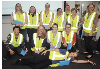
Figure 1. Monash Health AHA Day 2018 Working party.

The second Monash Health AHA Day (2018) was held at Holmesglen in Moorabbin, Victoria, for a full day. Participants attended from all over Australia. For the second time, demand was greater than capacity and participants contributed to a positive evaluation of the event.