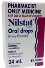
Figure 1- Nystatin