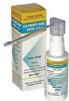
Figure 2- Co-Phenylcaine Forte