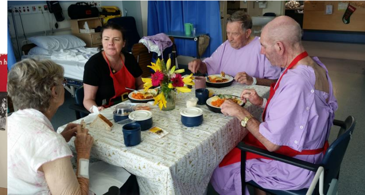
Ward 9BS, RBWH