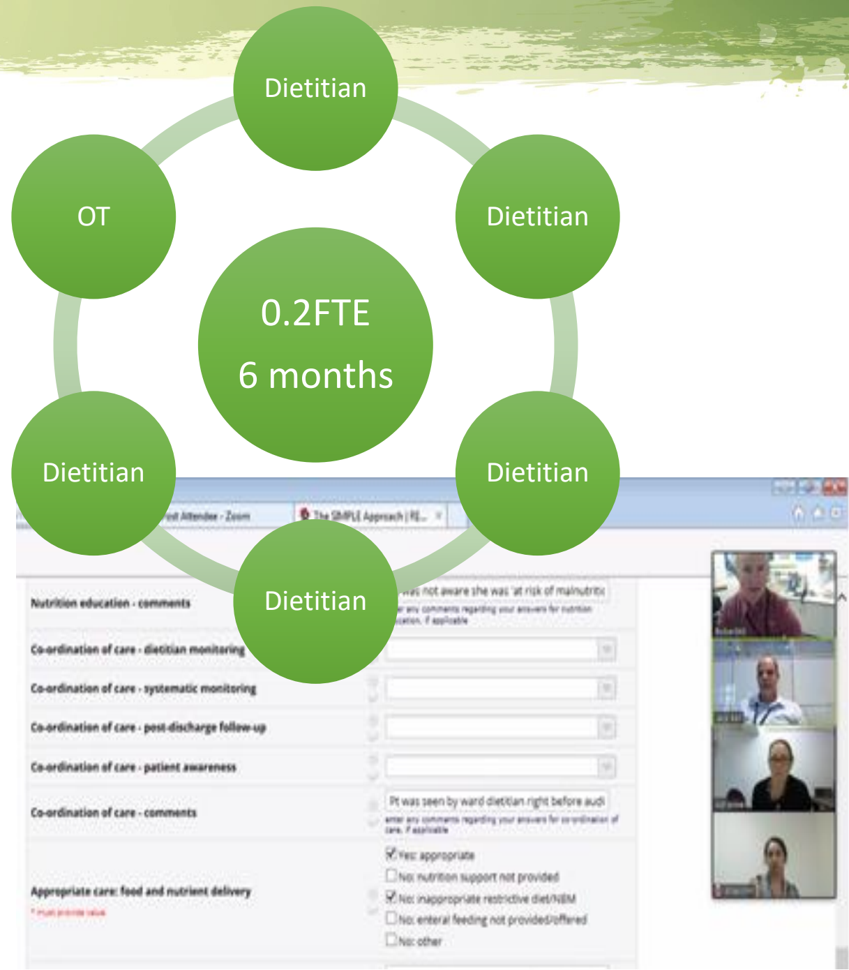
Screenshot of monthly Zoom virtual meeting

S Systematized I Interdisciplinary M Malnutrition P Program I Implementation and E Evaluation